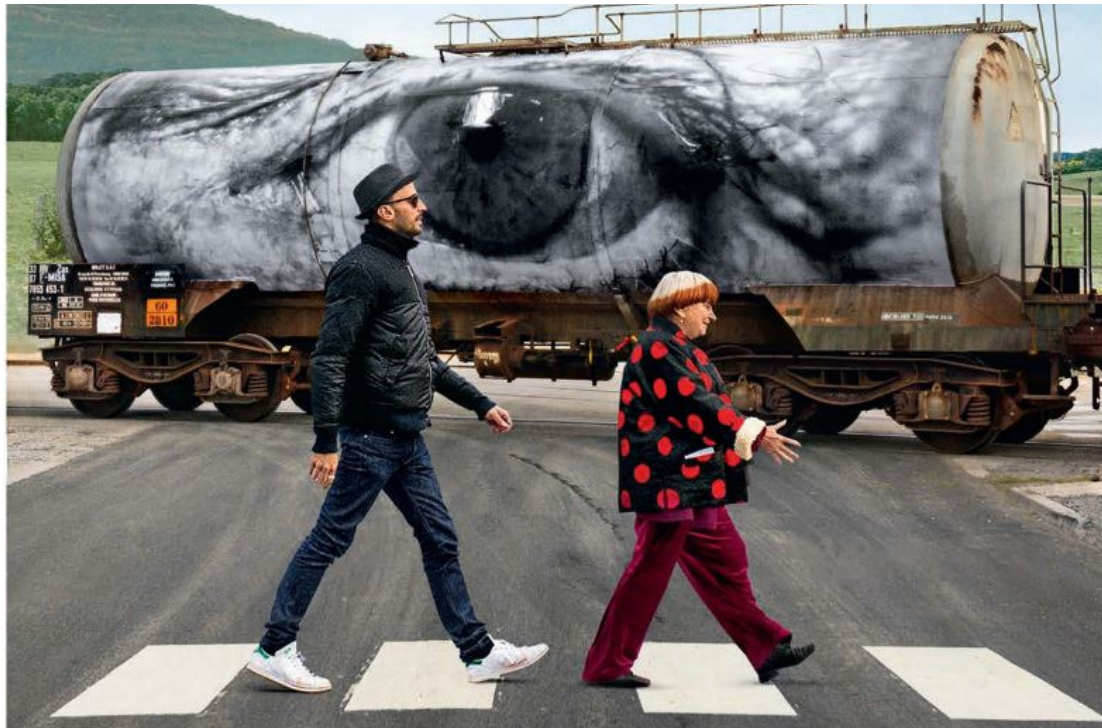
France: "Faces Places" March 15