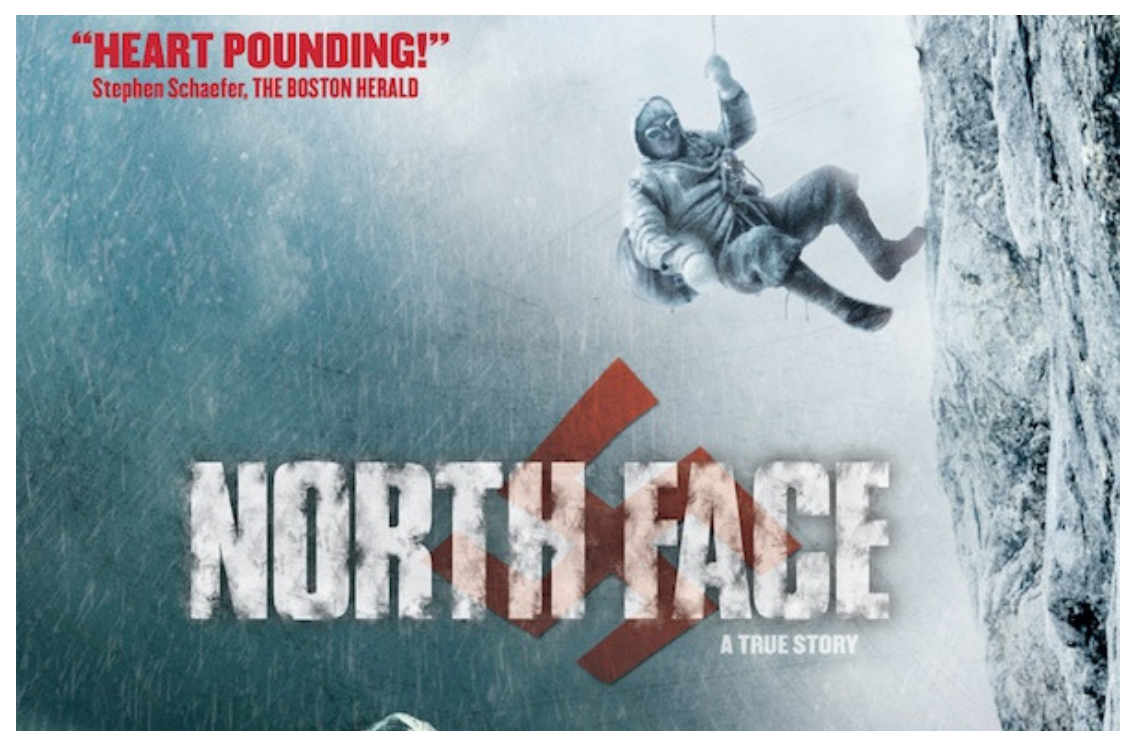
Germany: "North Face" April 19

Opening reception March 15 after film Closing reception April 19 after film