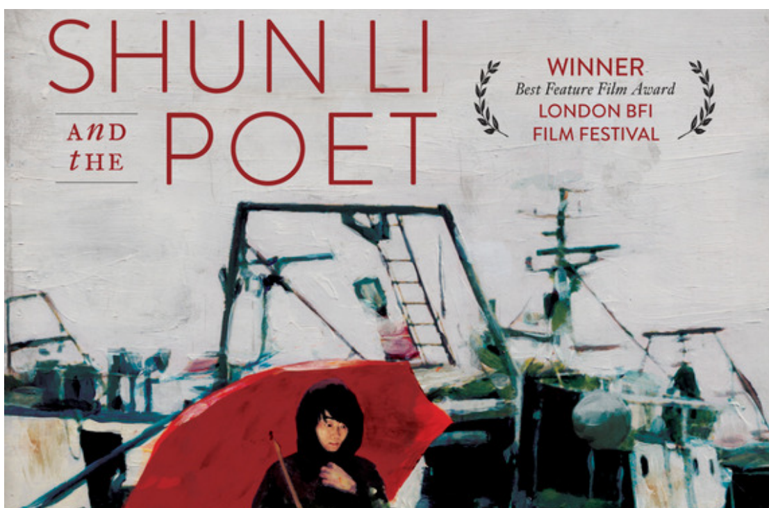
Italy: "Shun Li and the Poet" April 12